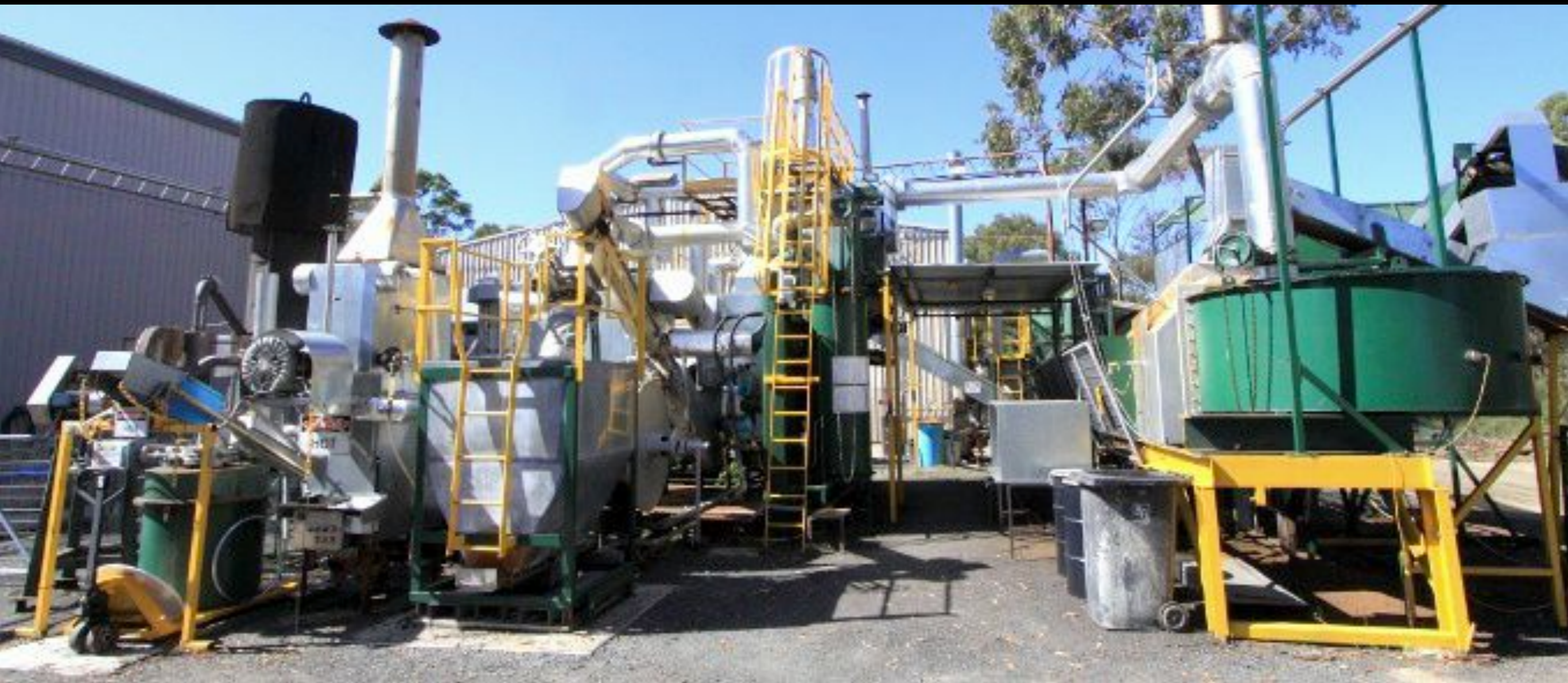
Pacific Pyrolysis pilot plant Capacity 300 kg/hr biomass